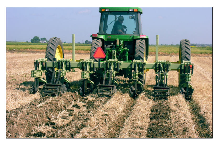
Figure 4. Ground-driven modified Orthman 1-tRIPr strip-tiller implement tilling in cover crop in center of tomato beds and sweeping out furrows for irrigation, Davis, California, 2006.