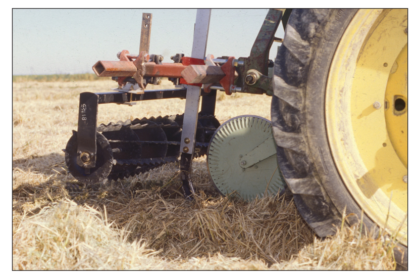
Figure 3. Basic components of early prototype strip-till implement used in California, including residue-cutting coulter, subsoiler shank, and clod-busting rolling basket, Five Points, California, 1996.

and variations on the strip-till tomato theme with both rotary-powered and ground-driven strip-tillage equipment have been made in recent years.