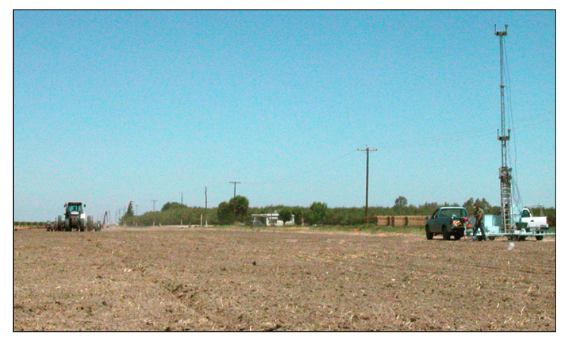
Figure 5. Downwind sampling of PM10 at Burrell, California, dairy, 2003.