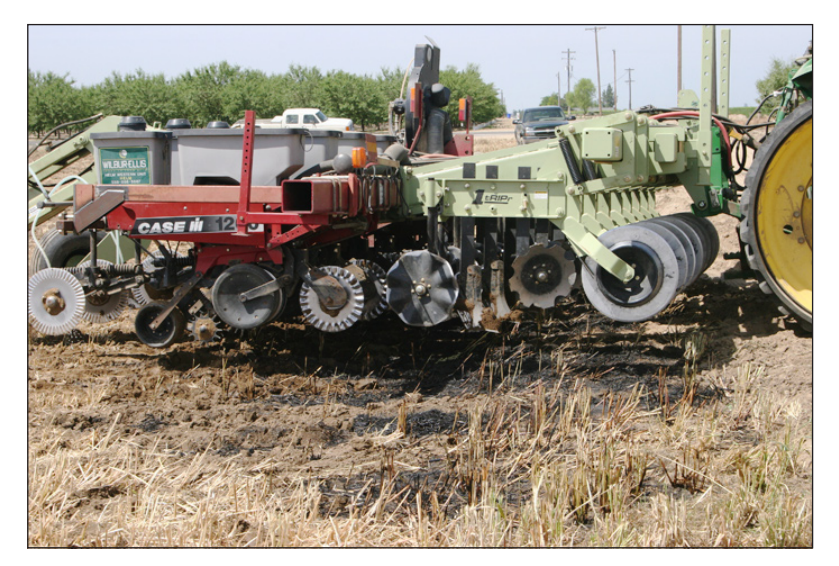
Figure 6. Orthman 1 tRIPr strip-tiller hooked up with planter for "one-pass" strip-tilling and planting, Kerman, California, 2006.

to planting winter forage, or for fall tillage prior to spring-planted crops such as cotton or tomatoes. With recently implemented waste discharge regulations that limit field applications of dairy waste nutrients to 140 to 165 percent of expected crop removal (see CVRWQCB 2007), triple-cropping of forages may become an important cropping system for dairies with limited forage production acreage. This system permits the production of more forage on the same acreage in a given time. Shortened intervals between crops also facilitates the capture of nitrogen before it becomes subject to leaching.