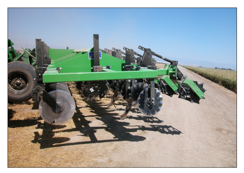
Figure 10. Bigham Brothers Terratill strip-tiller implement, showing residue-cutting coulters, subsoiling shanks, and clod-busting baskets.

uniform in nitrogen content, is less odiferous, has less viable weed seed, and will be mixed more efficaciously into the surface soil with the strip-tiller. Spreading raw manure can leave large clumps on the soil surface that can present problems for seeding, in addition to adding large amounts of weed seed. Local air quality regulations governing manure applications may also apply.