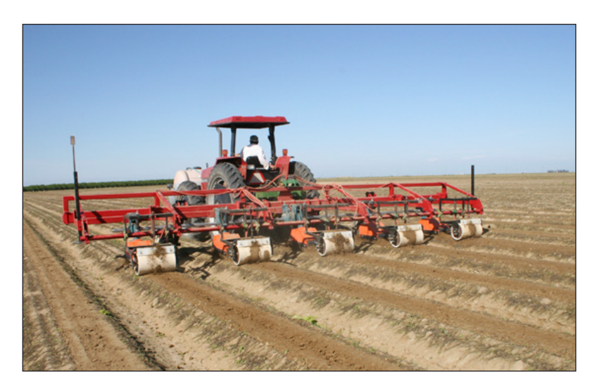
Figure 9. Five-row rotary strip-tiller tilling center of processing tomato beds prior to transplanting, Firebaugh, California, 2006.