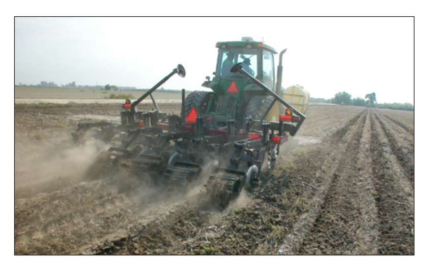
Figure 1. Strip-tilling into barley cover crop before cotton planting, Riverdale, California, 2001.