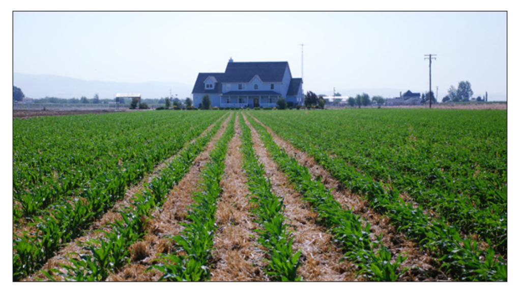
Figure 7. Strip-tilled forage corn stand, Frank Gwerder Dairy, Modesto, California, 2007.

At ten San Joaquin Valley farms in 2007, we compared stand establishment following striptillage with plant stands achieved with traditional tillage (fig. 7). Forage corn producers using striptillage tend to seek populations of between 28,000 and 36,000 plants per acre. While there were slight differences in stands achieved in strip-tilled fields relative to traditional tilled fields, particularly at a site in Turlock where strip-tilling was done before preirrigating and at a site in Hanford where a higher seeding rate was used in the traditional till field, generally adequate stands have been achieved using strip-till.